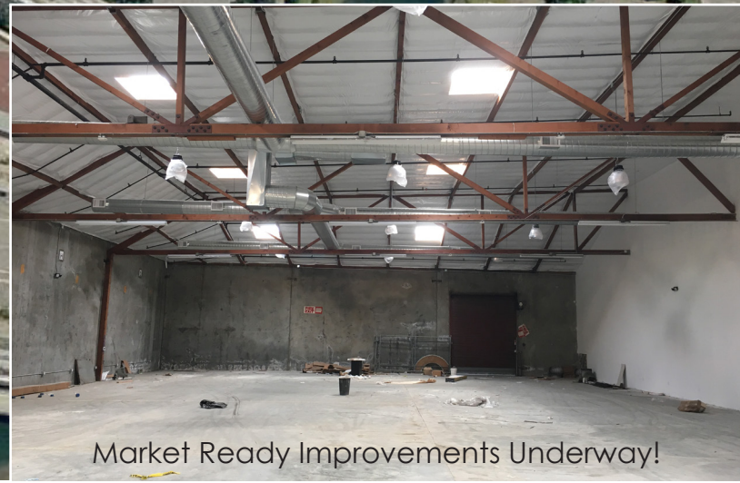
Market Ready Improvements Underway!